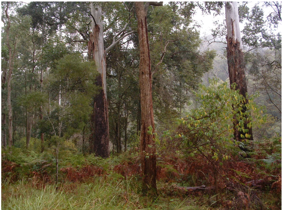
Photo 4. River-flat Eucalypt Forest, Crosslands

Conservation significance: River-flat Eucalypt Forest on Coastal Floodplains of the NSW North Coast, Sydney Basin and South East Corner Bioregions is listed as an endangered ecological community in the NSW Threatened Species Conservation Act 1995 . River-flat Eucalypt Forest is a rare and depleted community in Hornsby Shire, and prone to degradation from weed invasion. Endangered Community