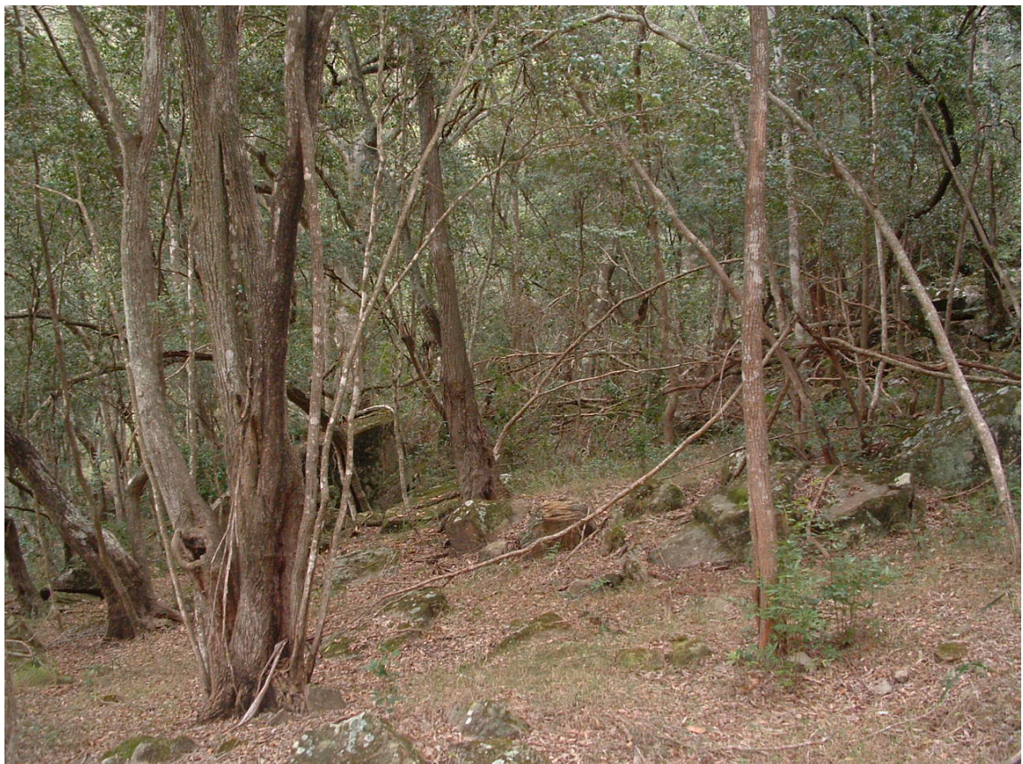
Photo 2. Grey Myrtle Rainforest, Wisemans Ferry