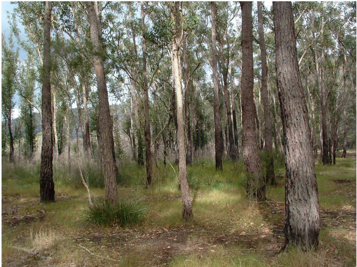
Photo 25. Swamp Mahogany Forest, One Tree Reach

Conservation significance: Swamp Mahogany Forest is a form of 'Swamp Sclerophyll Forest on Coastal Floodplains of the NSW North Coast, Sydney Basin and South East Corner Bioregions', which is listed as an endangered ecological community in the NSW Threatened Species Conservation Act 1995 . Endangered Community