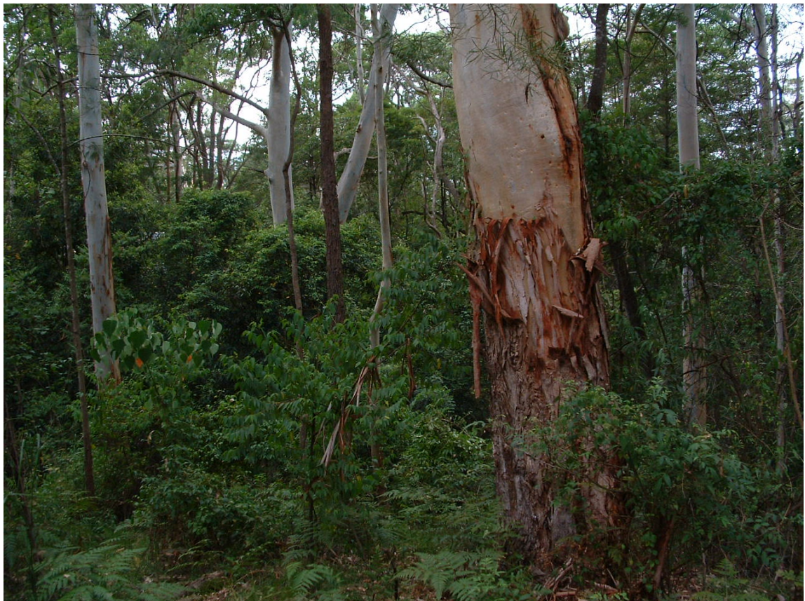
Photo 3. Blue Gum Shale Forest, Beecroft