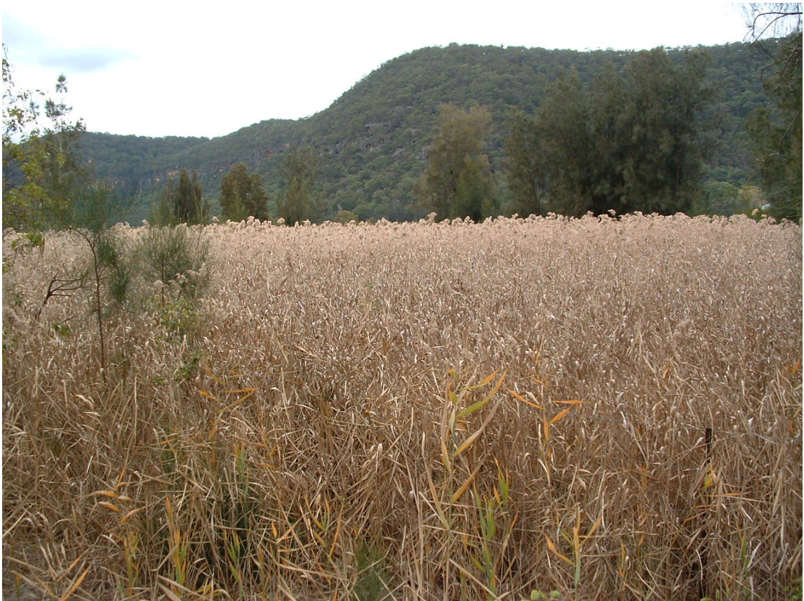
Photo 27. Floodplain Reedland, Wisemans Ferry

Conservation significance: Floodplain Reedland is a form of 'Swamp Sclerophyll Forest on Coastal Floodplains of the NSW North Coast, Sydney Basin and South East Corner Bioregions', which is listed as an endangered ecological community in the NSW Threatened Species Conservation Act 1995 . Endangered Community