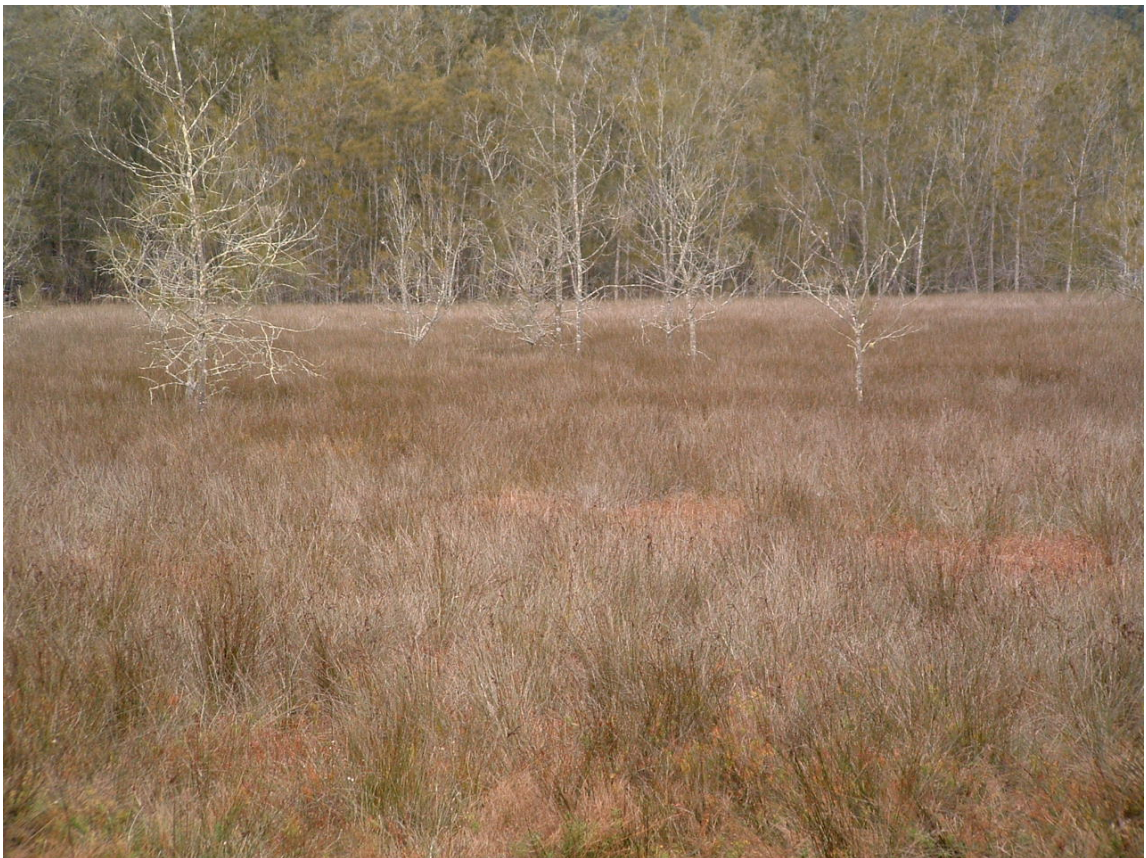
Photo 30. Coastal Saltmarsh, Singletons Mill

Conservation significance: Coastal Saltmarsh in the NSW North Coast, Sydney Basin and South East Corner Bioregions is listed as an endangered ecological community in the NSW Threatened Species Conservation Act 1995 . Endangered Community