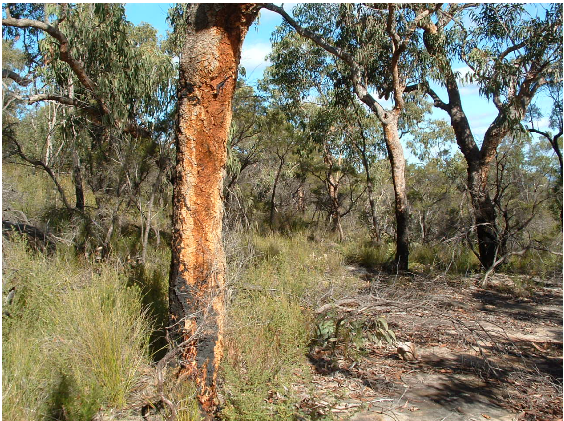
Photo 21. Yellow Bloodwood Woodland, Wisemans Ferry

Conservation significance: Well represented in Marramarra National Park (1097 ha; NSW Department of Environment and Conservation 2006) and, to a more limited extent, in Muogamarra Nature Reserve and Ku-ring-gai Chase National Park. Because of its steep, rocky habitat, little of the community has been cleared or disturbed.