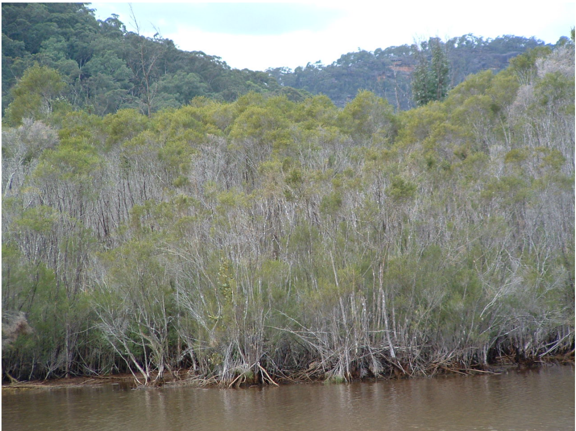
Photo 26. Floodplain Paperbark Scrub, One Tree Reach

Conservation significance: Floodplain Paperbark Scrub is a form of 'Swamp Sclerophyll Forest on Coastal Floodplains of the NSW North Coast, Sydney Basin and South East Corner Bioregions', which is listed as an endangered ecological community in the NSW Threatened Species Conservation Act 1995 . Endangered Community