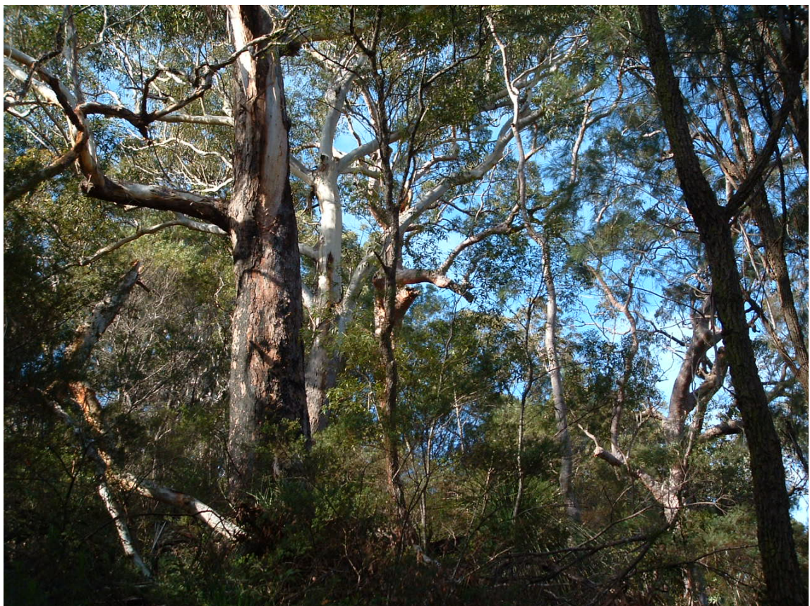
Photo 11. Blackbutt-Rough-barked Apple Forest, Dangar Island