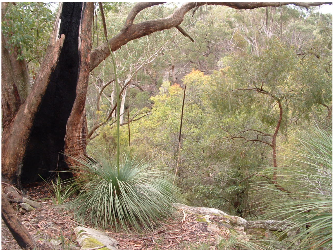
Photo 19. Narrow-leaved Apple Gully Forest, Glenorie

Conservation significance: Identified as a regionally significant community in the Hornsby Shire Biodiversity Conservation Strategy (Hornsby Shire Council 2004). Appears to be restricted to Hornsby Shire, with only 4 ha (4% of its total extent) reserved in Berowra Valley Regional Park. Regionally Significant Community