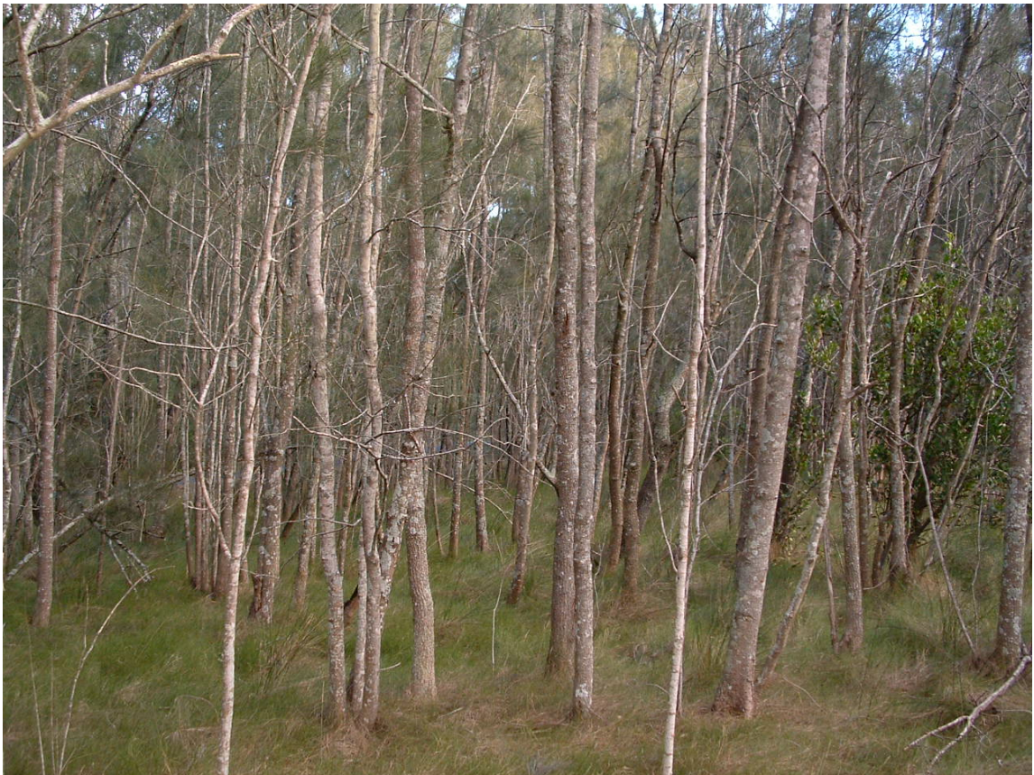
Photo 28. Swamp Oak Floodplain Forest, Singletons Mill

Conservation significance: Swamp Oak Floodplain Forest of the NSW North Coast, Sydney Basin and South East Corner Bioregions is listed as an endangered ecological community in the NSW Threatened Species Conservation Act 1995 . Endangered Community