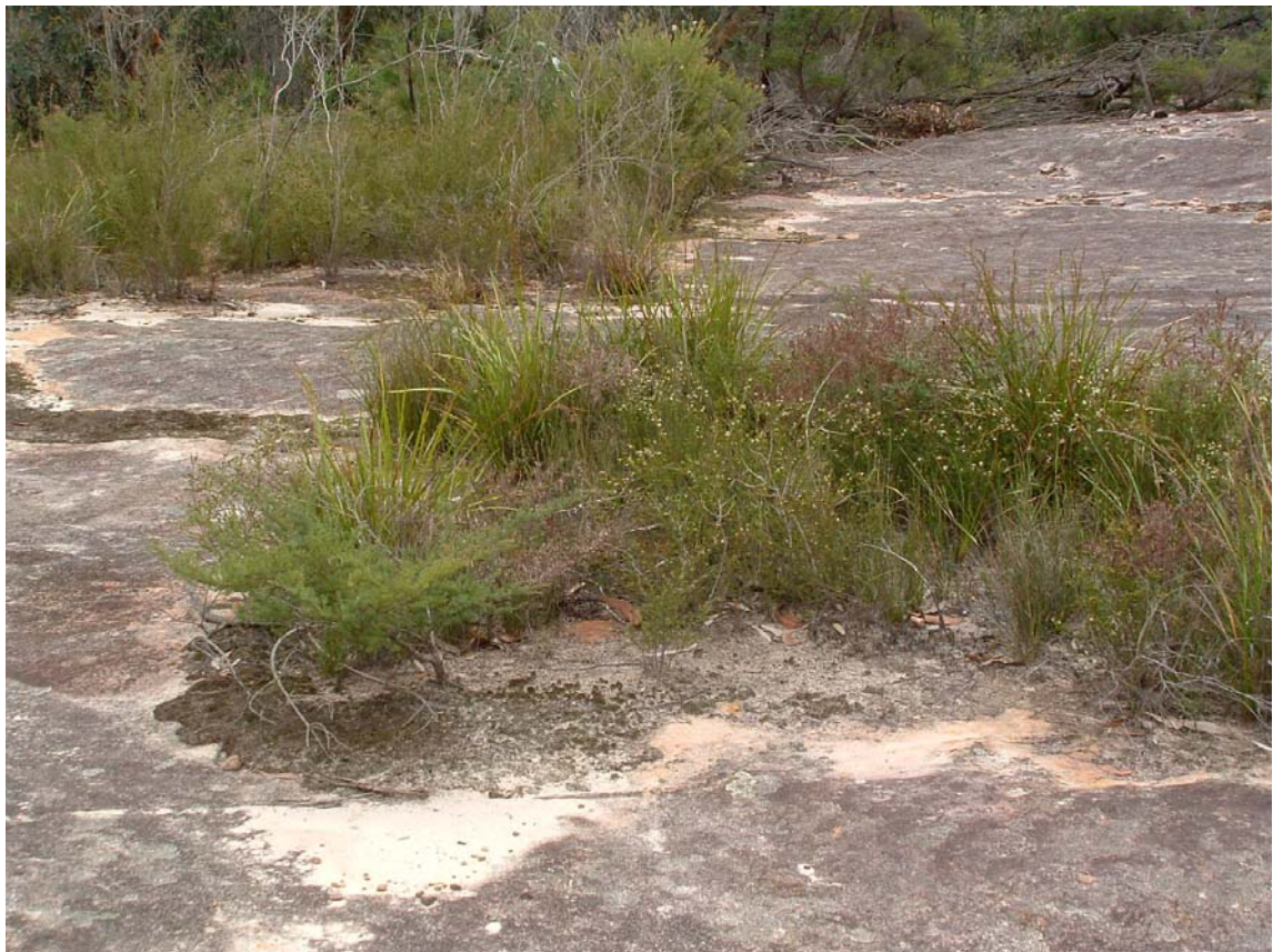
Photo 23. Rock Platform Heath, Canoelands