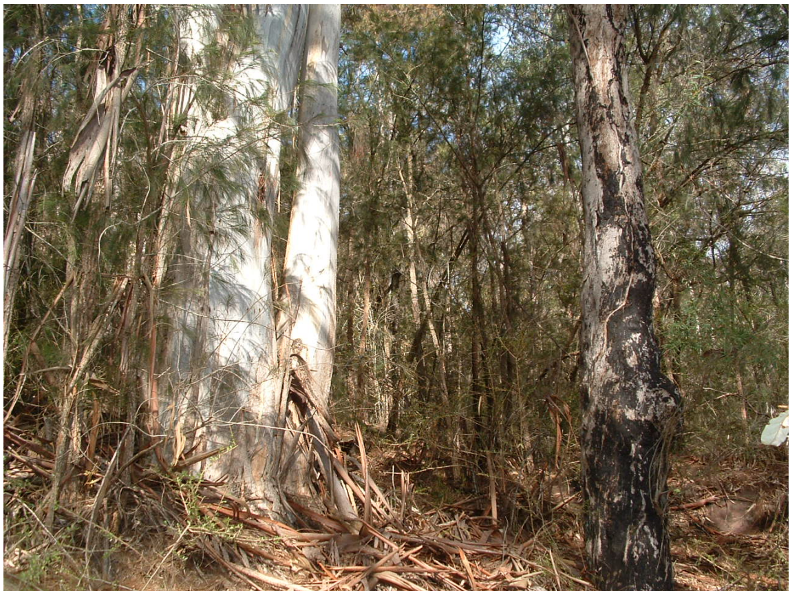
Photo 12. Narrow-leaved Apple Slopes Forest, Singletons Mill