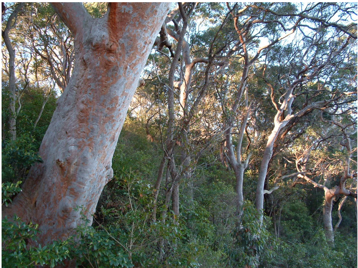
Photo 18. Angophora Woodland, Brooklyn