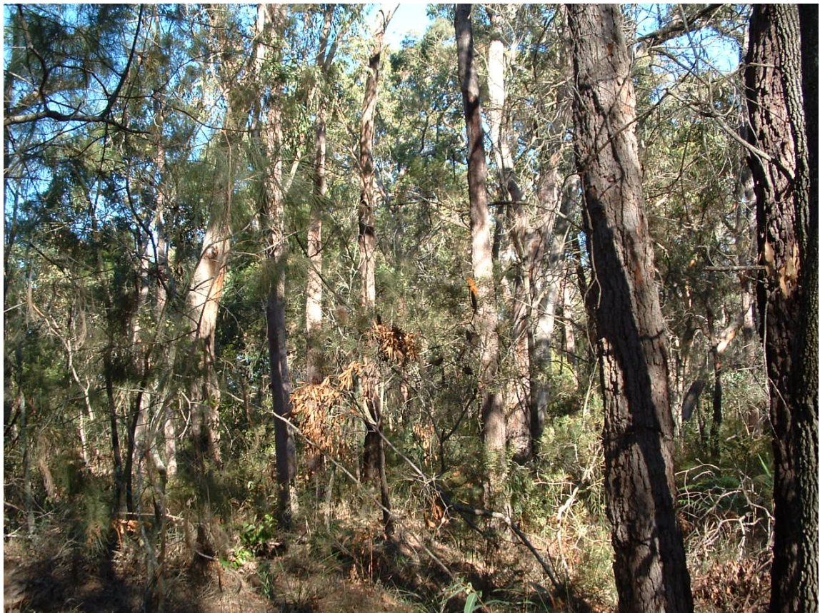
Photo 13. Shale/Sandstone Transition Forest, Maroota