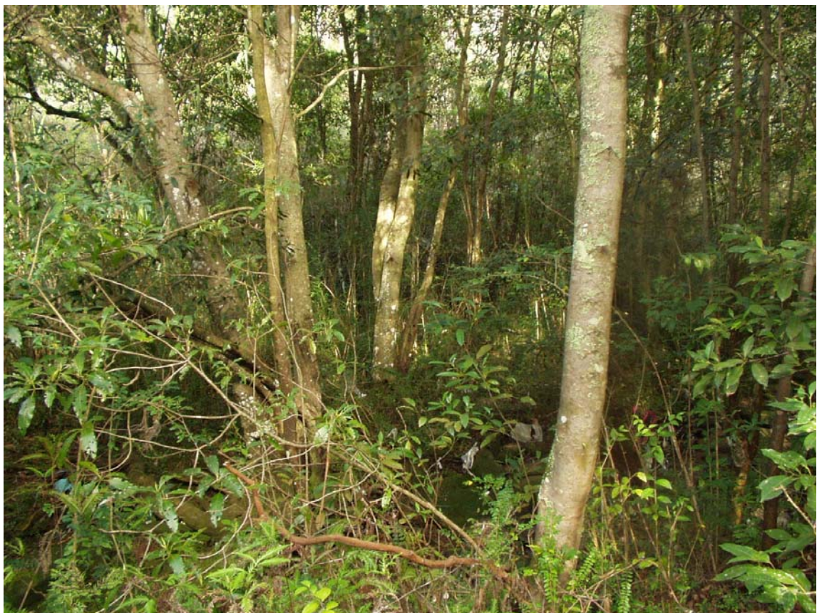
Photo 1. Coachwood Rainforest, Asquith

Conservation significance: Identified as a regionally significant community in the Hornsby Shire Biodiversity Conservation Strategy (Hornsby Shire Council 2004). It is an uncommon community in the Sydney region and is particularly prone to weed invasion, especially by Ligustrum sinense (Small-leaved Privet). Regionally Significant Community