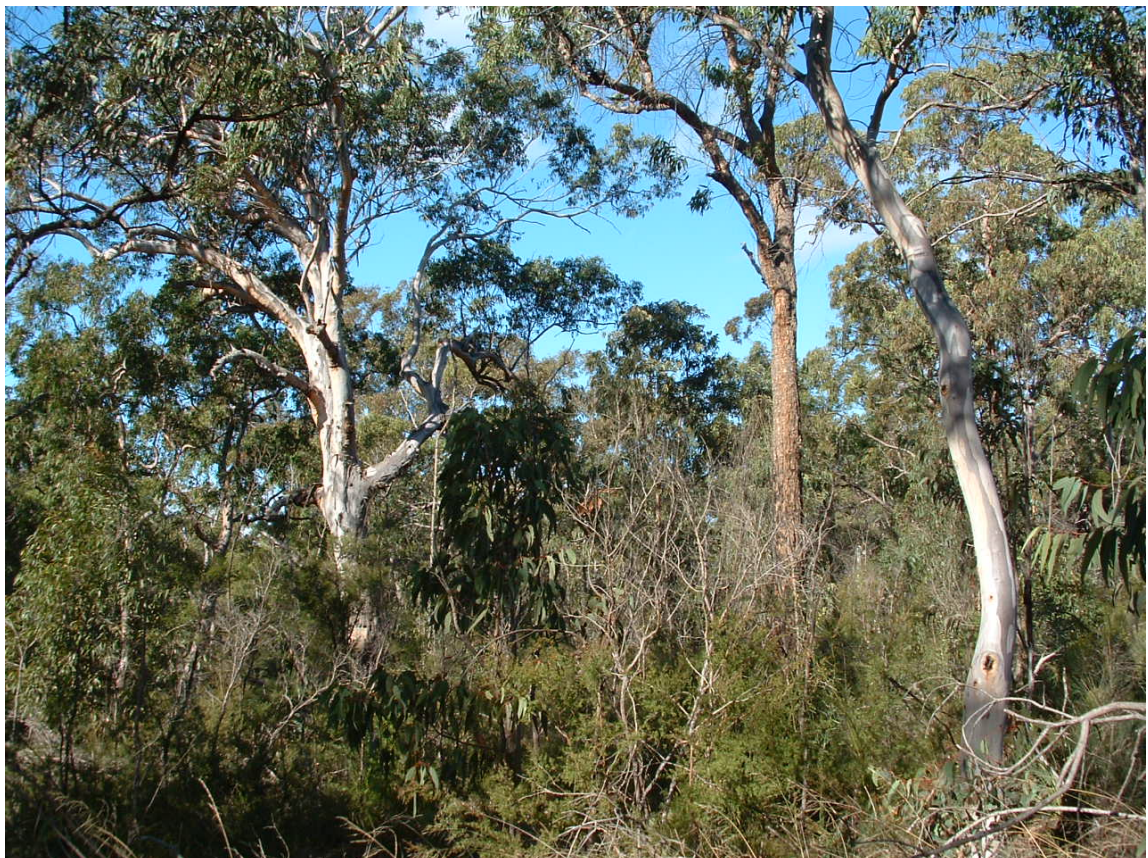
Photo 20. Grey Gum-Scribbly Gum Woodland, Canoelands

Conservation significance: A common community in Hornsby Shire, well represented in Marramarra National Park and, to a lesser extent, in Muogamarra Nature Reserve and Berowra Valley Regional Park.