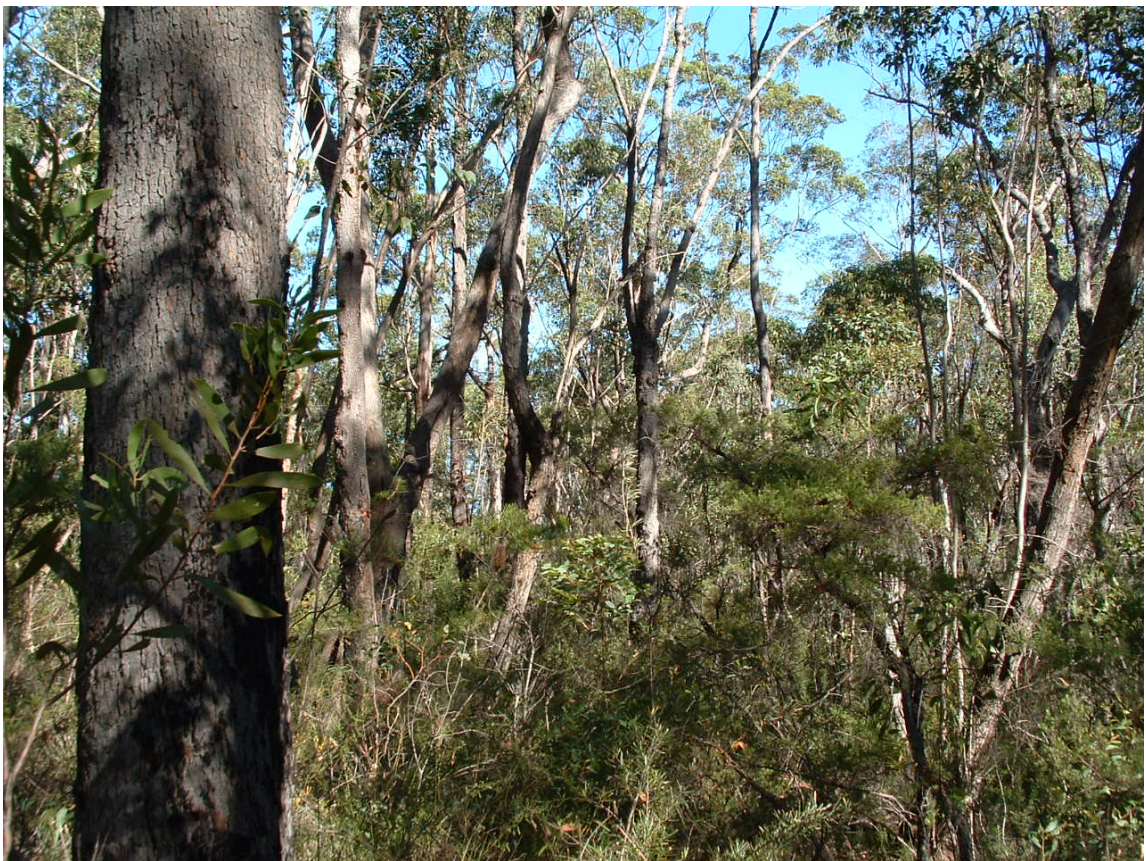
Photo 8. Duffys Forest, Dural