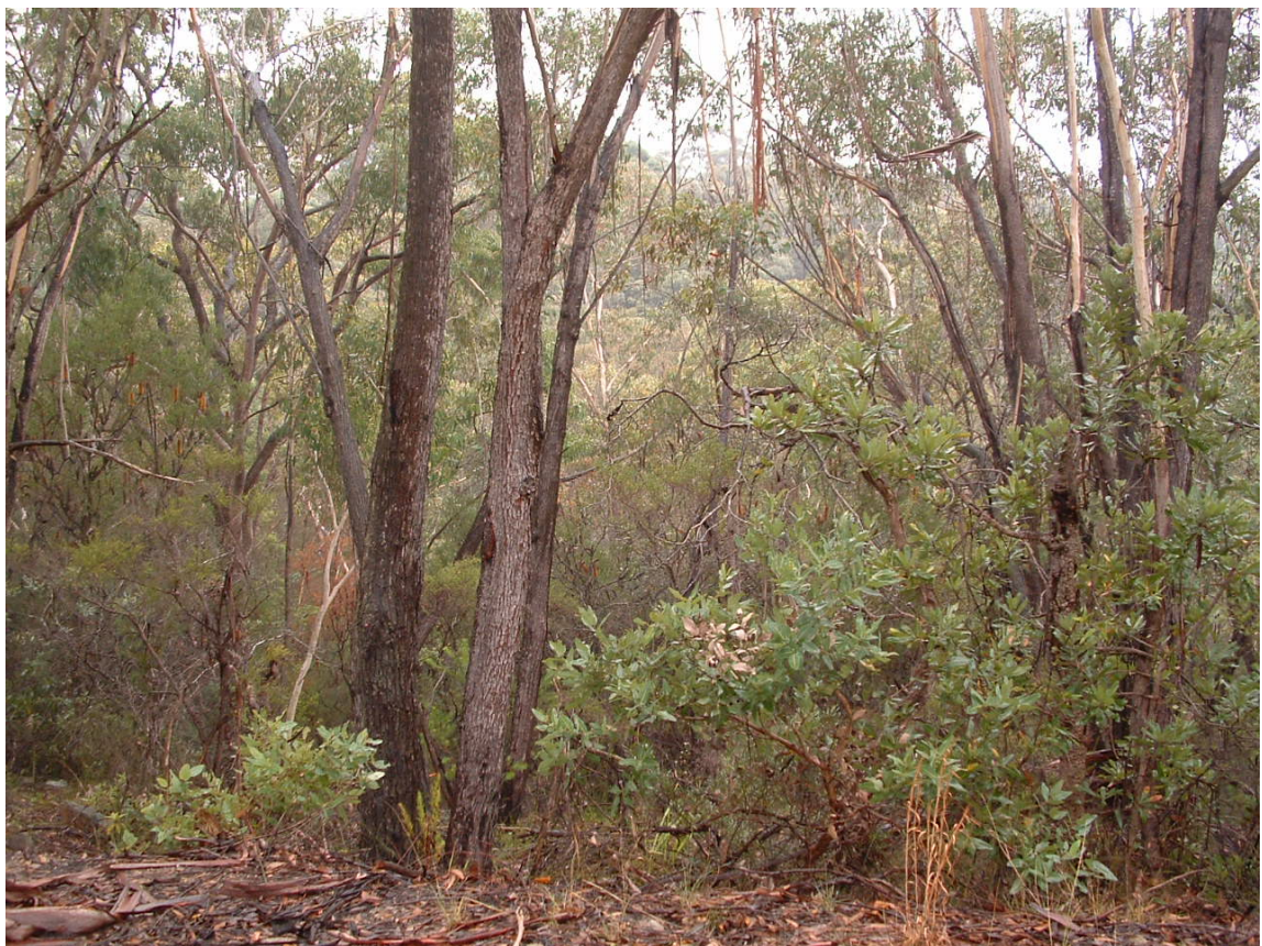
Photo 16. Silvertop Ash-Scribbly Gum Woodland, Asquith

Conservation significance: Identified as a locally significant community in the Hornsby Shire Biodiversity Conservation Strategy (Hornsby Shire Council 2004). A rare community in the survey area, poorly represented in Berowra Valley Regional Park, and threatened by urban development because of its association with plateaus and ridgetops. Locally Significant Community