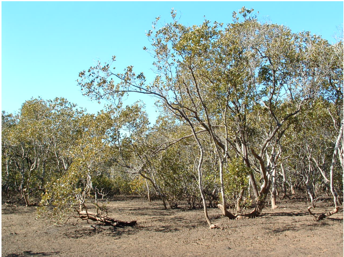
Photo 29. Mangrove Swamp, Brooklyn

Conservation significance: Identified as a locally significant community in the Hornsby Shire Biodiversity Conservation Strategy (Hornsby Shire Council 2004). Mangroves are vital for maintaining the ecological health and productivity of estuaries, playing important roles as primary producers and as fish habitat. Locally Significant Community