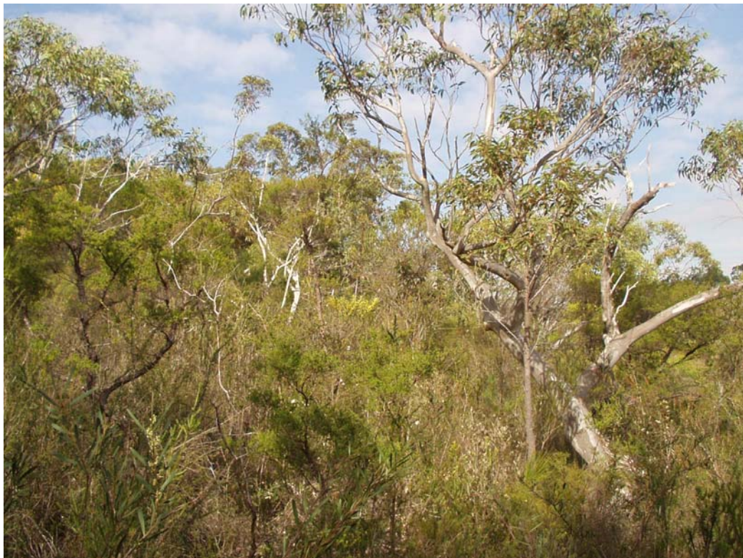
Photo 22. Scribbly Gum Open-woodland/Heath, Mt Kuring-gai

Conservation significance: A common community in Hornsby Shire, well represented in local conservation reserves.