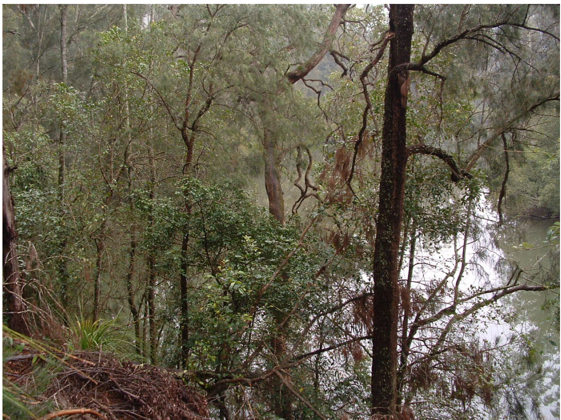
Photo 10. Rough-barked Apple-Forest Oak Forest, Crosslands