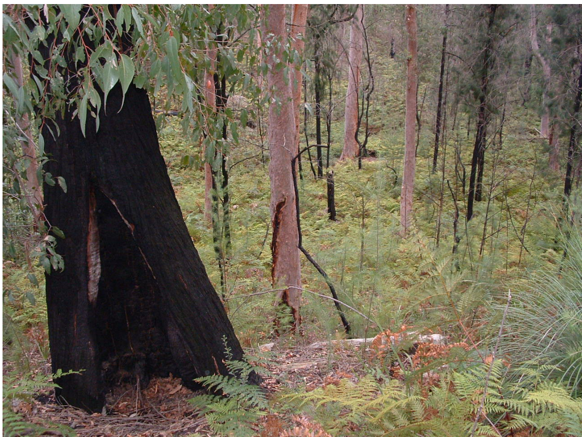
Photo 6. Blue-leaved Stringybark Diatreme Forest, Fiddletown