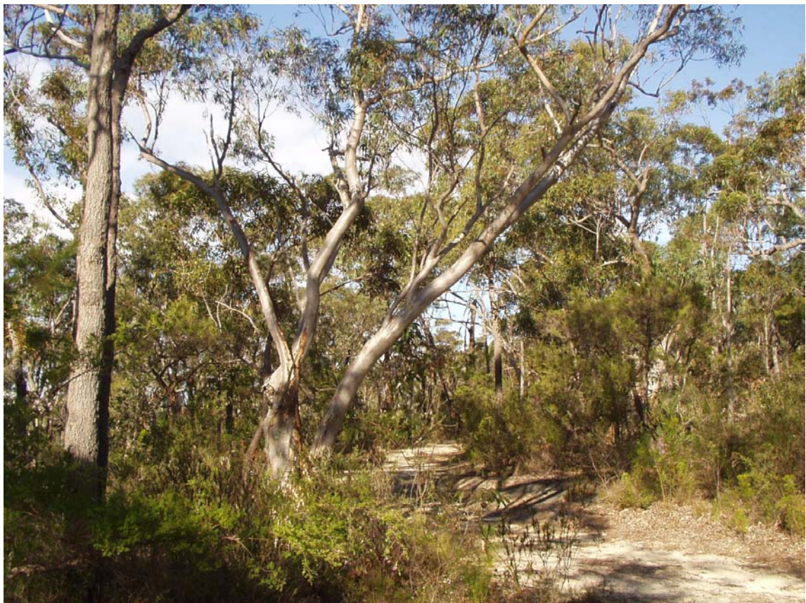
Photo 17. Narrow-leaved Scribbly Gum Woodland, Mt Kuring-gai

Conservation significance: A common community in Hornsby Shire, well represented in Berowra Valley Regional Park and other local conservation reserves.