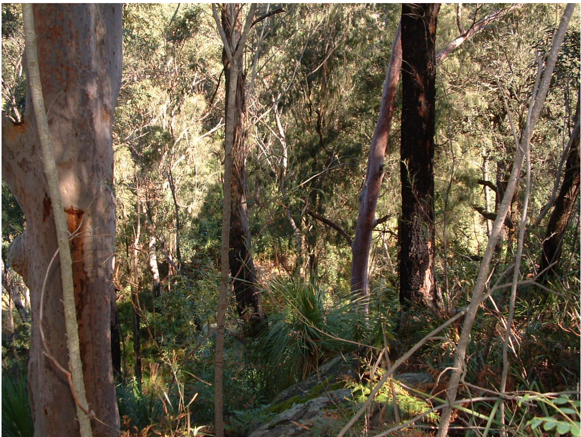
Photo 14. Peppermint-Angophora Forest, Brooklyn

Conservation significance: The most common community in Hornsby Shire. Well represented in local conservation reserves.