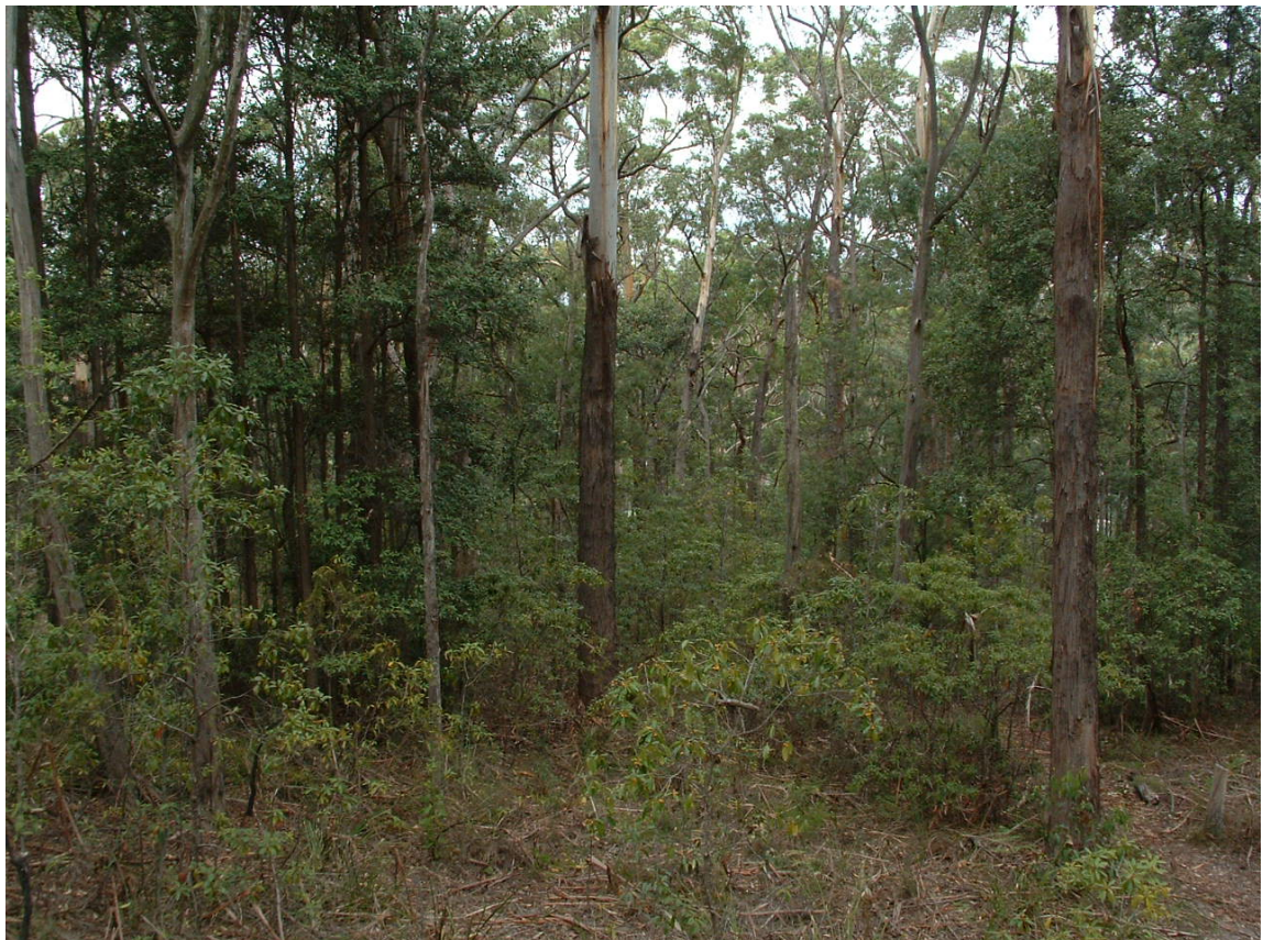
Photo 9. Blackbutt Gully Forest, Beecroft