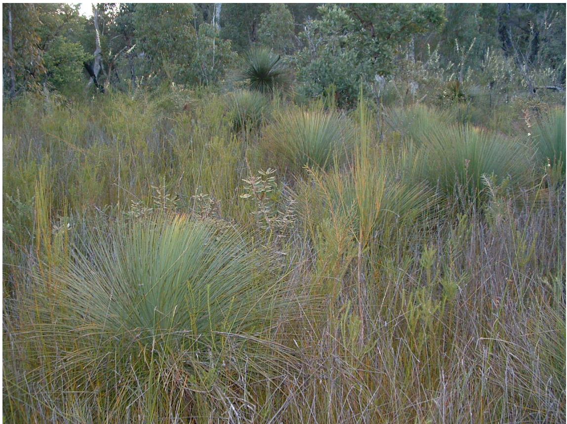
Photo 24. Sandstone Swamp, Berowra Heights