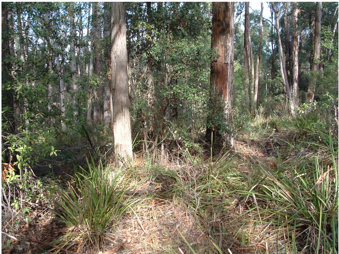
Photo 7. Turpentine-Ironbark Forest, Cherrybrook