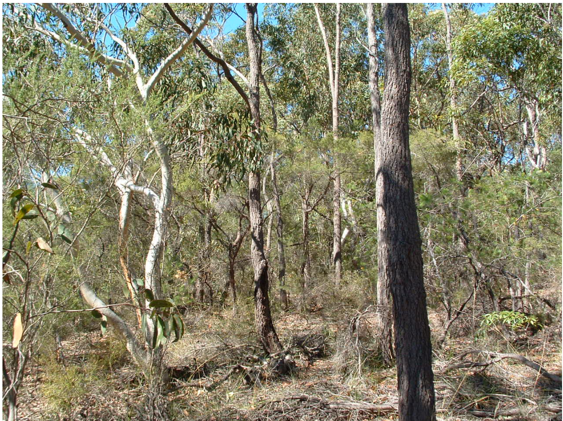
Photo 15. Bloodwood-Scribbly Gum Woodland, Dural