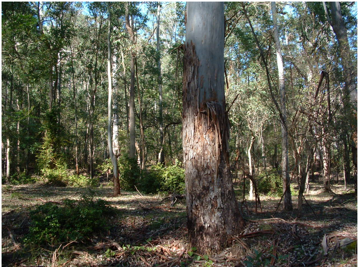
Photo 5. Blue Gum Diatreme Forest, Hornsby